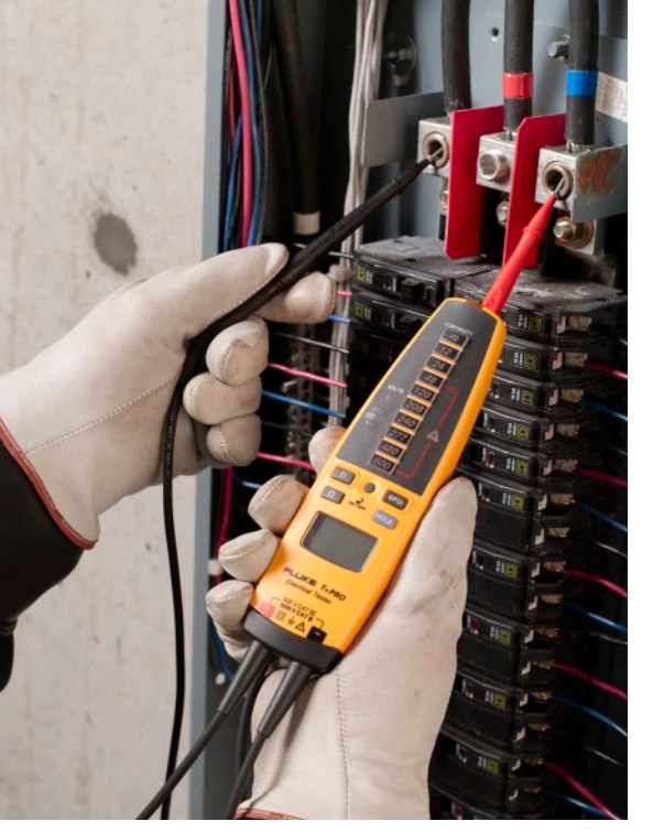
Electronic testers like this Fluke T<sup>+</sup> vibrate, beep, and glow to indicate voltage, giving you the feel of an old-fashioned solenoid in a safer electronic model.

ability to measure higher voltages limits the capability to detect voltages below about 100 V due to the poor dynamic range of the magnetics, an unfortunate weakness of solenoid testers. Try using one on 24 V or 48 V control circuits, and you may as well be using a stick of wood.